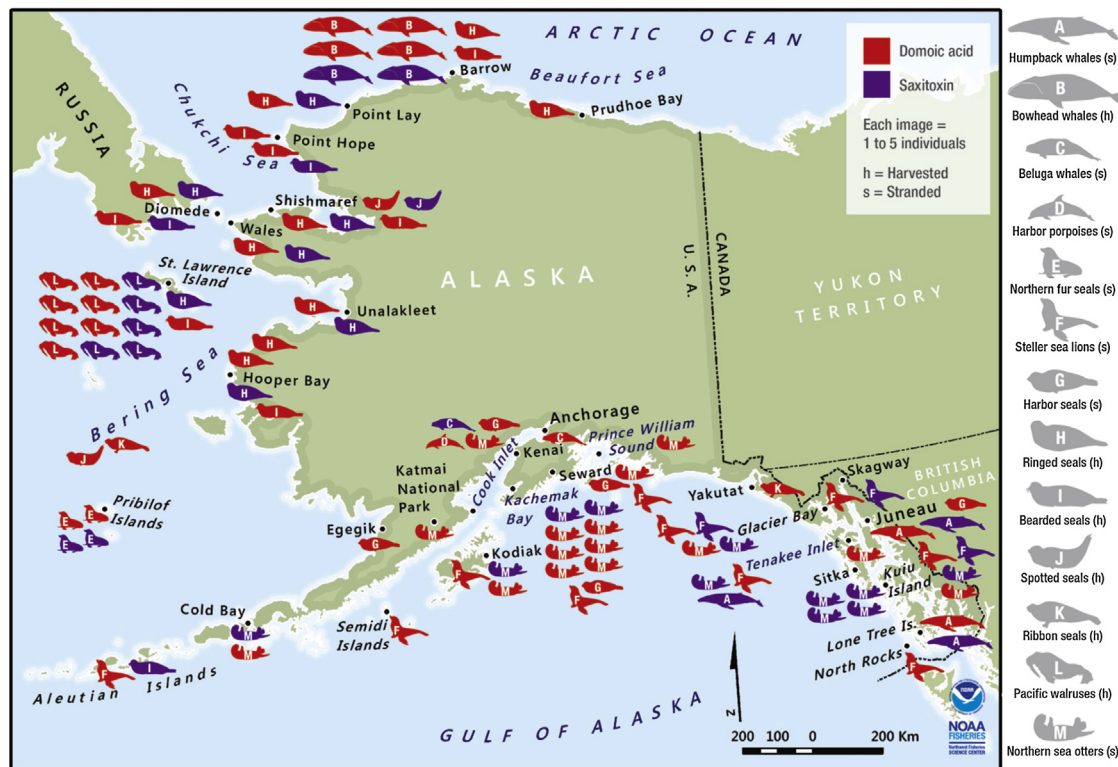
Fig. 1. Locations where algal toxins were detected in stranded (s) and harvested (h) marine mammals. Red images represent species positive for domoic acid (DA) and purple images represent species positive for saxitoxin (STX). Marine mammal species are listed as follows: (A) humpback whales, (B) bowhead whales, (C) beluga whales, (D) harbor porpoises, (E) northern fur seals, (F) Steller sea lions, (G) harbor seals, (H) ringed seals, (I) bearded seals, (J) spotted seals, (K) ribbon seals, (L) Pacific walruses and (M) northern sea otters.

lions (Maucher and Ramsdell, 2005, 2007; Ramsdell and Zabka, 2008). In the present study, one beluga whale fetus, one harbor porpoise fetus, and one Steller sea lion fetus contained detectable concentrations of DA in stomach contents and feces, further documenting the risk of maternal transfer of toxins from pregnant females with environmental exposures to these biotoxins. Additionally, several sea otter pups and harbor seal neonates contained detectable concentrations of DA, however whether they were actively nursing is unknown. The diets of the 13 species tested in this study are varied due to their diverse marine mammal life histories and range from zooplankton, to benthic invertebrates, to finfish.